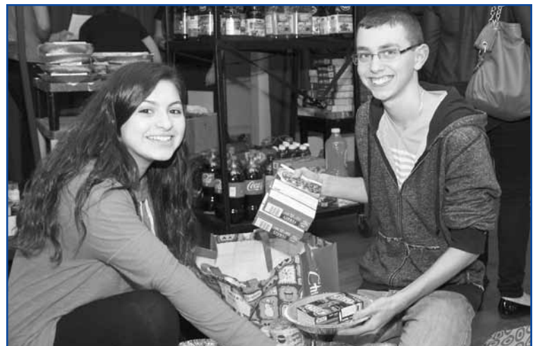
High school students gathered, sorted and boxed up food for delivery to make sure the holidays were happy for those in need.