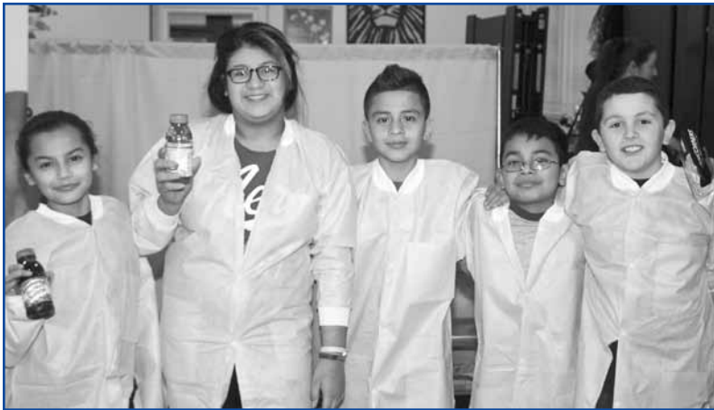
Elementary students participate annually in the Long Island Blood Services Little Doctors Program by assisting at the facilities' blood drives.

2012-2013 per-pupil expenditures showed that Hicksville was the third lowest of 42 K-12 school districts in Nassau County.