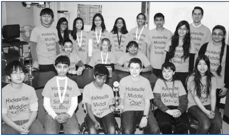
The middle school (above) and high school (top right) Science Olympiad teams both advanced to the state regional competition. These teams prepared throughout the year for competitions that required them to solve problems in genetics, earth science, chemistry, anatomy, physics, geology and mechanical engineering.

Yes. The proposed budget carries a tax levy increase of $92,823, or .09 percent. This requires a simple majority approval (50 percent of the vote plus 1). If the district were to propose a tax levy increase above .09 percent, a supermajority approval of 60 percent would have to be attained.