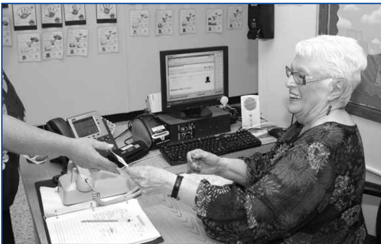
Combinations of staff, computers, cameras, speakers, buzzers and special lighting work in tandem in district school buildings to enhance security.

District administration and the Board of Education remain committed to improving our school facilities to ensure the safety of students and staff, enhance learning and protect the investment of our taxpayers. Renovations and improvements are made to our facilities annually to assist us in achieving this goal. In addition, we wish to continue to have the condition of our facilities serve as a point of pride in our community. The budget contains the funds necessary to make these improvements. These projects are based upon the recommendations of our engineers' and architects' inspection of the district facilities as contained in the 5-year building condition survey, as well as a continuation of our energy efficiency plan and improvements that will continue to support our students and programs. Capital projects currently generate state building aid at approximately 27 percent, payable over 15 years.