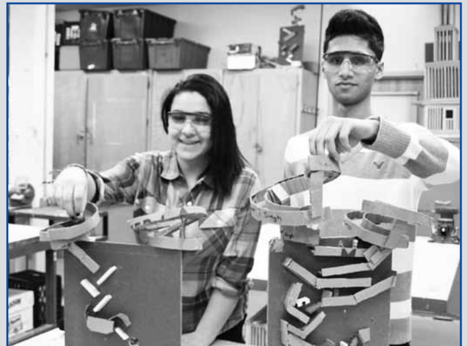
Students are instructed in STEM (science, technology, engineering and mathematics) in all grades to grow their minds for better career choices.

*District Financial Plan provides for $3,069,000 to be applied each of the next four years to mitigate the impact of budget expenditures.